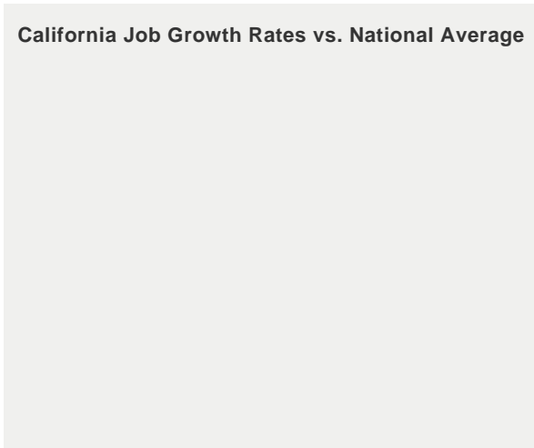
California Job Growth Rates vs. National Average